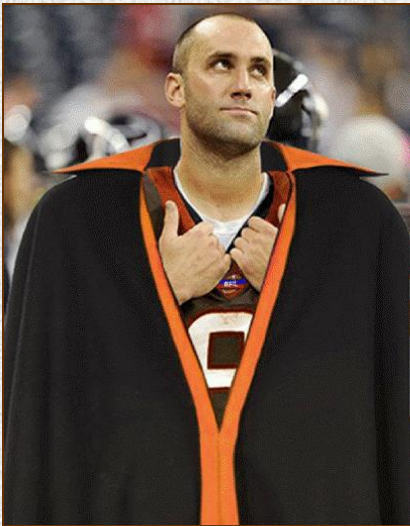
Matt Schaub , the official starting QB for Durham, stands on the sideline in full-length cape as Philip Rivers fills in for him on the field versus Iowa City. A heightened injury-awareness has Schaub and the team taking no chances.