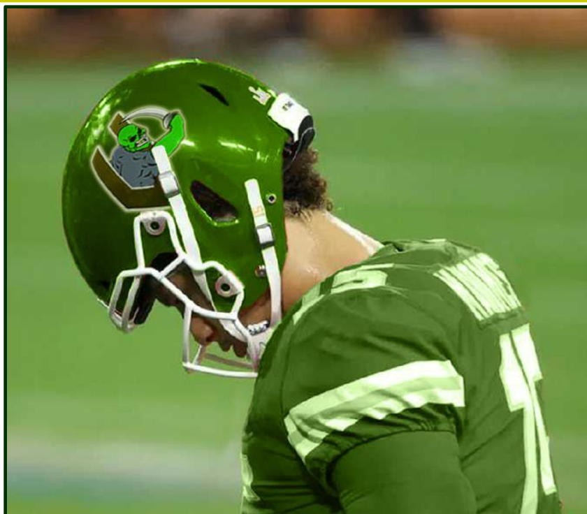
Patrick Mahomes hangs his head as he walks off the field in Peg City following his team’s Gale Sayers Game loss to Durham. The young Virden phenom is accused of not being to win the big game.