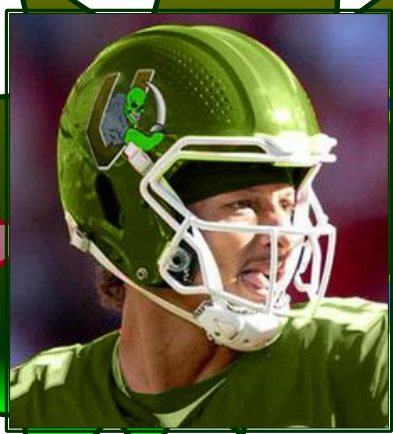
PATRICK MAHOMES VIRDEA VIOLATORS