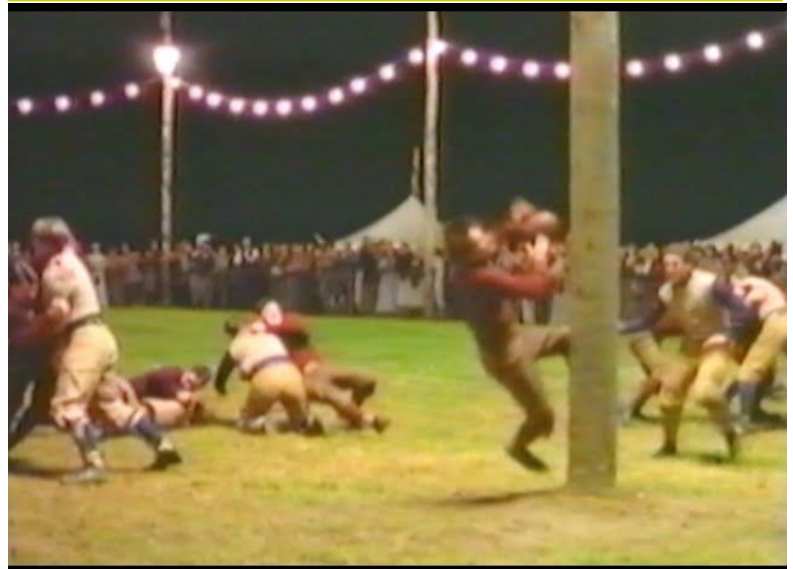
A rare photo of a night game between the Dugger Pitmen and the Fostoria Glassmakers of the Gentleman’s Football League. This shot was taken with a Kodak Brownie, state-of-the-art 1920’s camera. The GFL banned live TV coverage to preserve football’s roots and paid the price by lasting half a season.

With the EFL now in a prime position to absorb the remainder of pro-worthy talent in what remains of the rival pro leagues, league officials are hinting at another expansion. From a strict business viewpoint this makes perfect sense – for many, that would be the end of the discussion. However, true fans of the sport – the most competitive football purists – dread such a move. In their view, the EFL is close to perfect from a