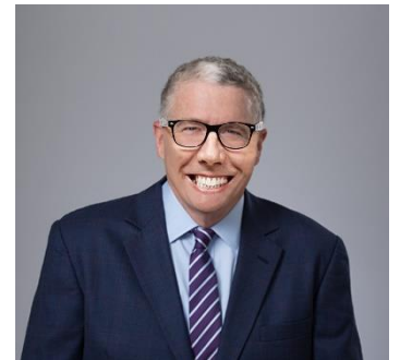
By PETER PRINCE AND THE TMQB STAFF