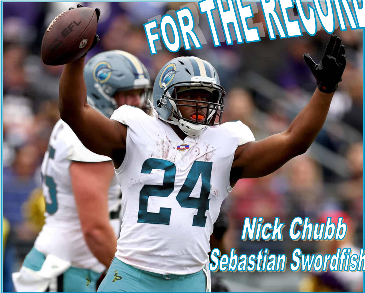
Nick Chubb Sebastian Swordfish

Swordfish running back, Nick Chubb celebrates his third touchdown of the game, which turned out to be enough to give Sebastian its first win of the season, 37-30 over Scarborough. Chubb's 252-yard rushing effort set an EFL single game record, eclipsing the 249 yards of Willis McGahee of Death Valley set in 2012. (Story inside)