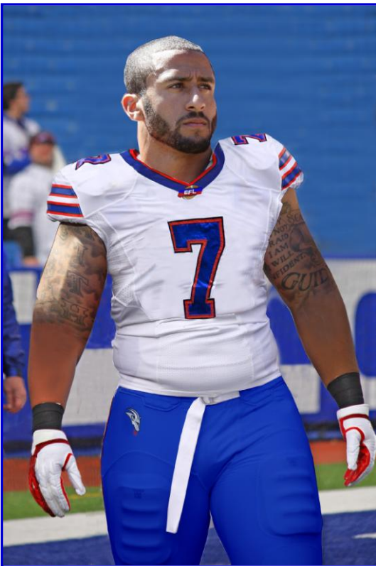
Cubs' back-up QB, Colin Kaepernick watches his team from the sideline. Once a hot prospect and contender for the starting job, Kaepernick is reportedly depressed, gaining weight, and becoming less tradable and playable every week.